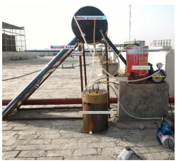
Fig.5 Complete setup of the system

The complete setup of our working model is shown in Fig.5