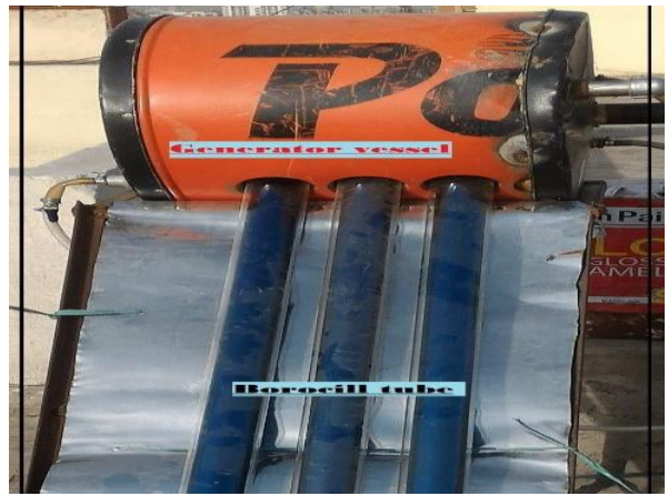
Fig.2 complete set of generator

placed at 45^{\circ} with the help of stand. The capacity of one tube is 2.8 litre.